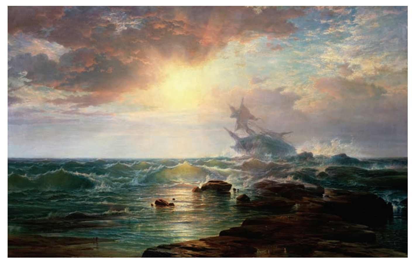
The Calm After the Storm (1866), Edward Moran. Oil on canvas. Private collection.

Trust no Future, howe'er pleasant! Let the dead Past bury its dead! Act,—act in the living Present! Heart within, and God o'erhead!